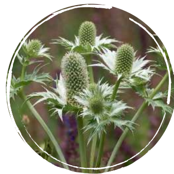
Miss Willmott's ghost